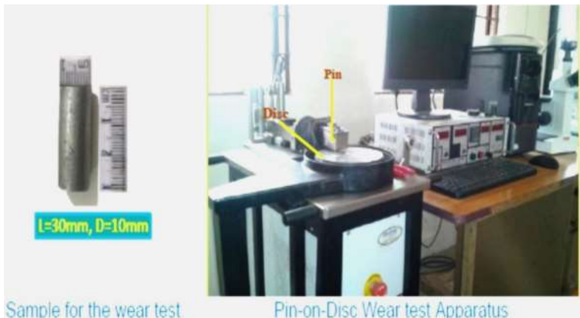
Fig. 1: Sample and dry-sliding-wear-test apparatus for wear-test.

Aluminium-1%Mg-silicon carbide composite was manufactured by plunger technology which has been published elsewhere. Here plunger rods are used to introduce silicon carbide particle to the Al-Mg alloy melt and the composites are manufactured as per required composition. The furnace temperature has great influence on hardness and wear properties. Sliding wear is conducted in dry condition using Pin-On-Disc method where pin is the sample. The instrument used is DUCOM-WEAR TEST apparatus as shown in Figure-i and Figure-ii. The pin (sample) and disk (EN31 steel) was cleaned by Emory paper so that smooth contact will take place between pin and disk. The test was conducted using the standard ASTM G-99 at room temperature. The mass loss of the sample made of prepared composite is calculated by measuring the initial mass and final mass using the weight balance. The sp. wire rate is calculated using the formula-1.