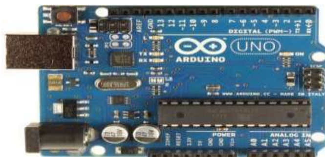
Figure.3. Arduino Uno

The Arduino Uno can be powered via the USB connection or with an external power supply. The power source is selected automatically. External (non-USB) power can come either from an AC-to-DC adapter (wall-wart) or battery. The adapter can be connected by plugging a 2.1mm center-positive plug into the board's power jack. Leads from a battery can be inserted in the Ground and Vin pin headers of the POWER connector. The board can operate on an external supply of 6 to 20 volts. If supplied with less than 7V, however, the 5V pin may supply less than five volts and the board may be unstable. If using more than 12V, the voltage regulator may overheat and damage the board. The recommended range is 7 to 12 volts.