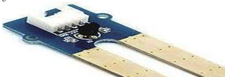
Figure.3. Moisture Sensor

Soil moisture sensors measure the volumetric water content in soil. Since the direct gravimetric measurement of free soil moisture requires removing, drying, and weighting of a sample, soil moisture sensors measure the volumetric water content indirectly by using some other property of the soil, such as electrical resistance, dielectric constant, or interaction with neutrons, as a proxy for the moisture content. The relation between the measured property and soil moisture must be calibrated and may vary depending on environmental factors such as soil type, temperature, or electric conductivity. Reflected microwave radiation is affected by the soil moisture and is used for remote sensing in hydrology and agriculture. Portable probe instruments can be used by farmers or gardeners.