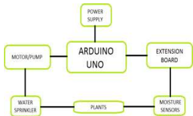
Figure.1. Automatic Plant Watering Block Diagram

There are two functional components in this project. They are the moisture sensors and the motor/water pump. Thus the Arduino Board is programmed using the Arduino IDE software. The function of the moisture sensor is to sense the level of moisture in the soil. The motor/water pump supplies water to the plants. This project uses Arduino Uno to controls the motor. Follow the schematic to connect the Arduino to the motor driver, and the driver to the water pump. The motor can be driven by a 9 volt battery, and current measurements show us that battery life. The Arduino Board is programmed using the Arduino IDE software. The moisture sensor measures the level of moisture in the soil and sends the signal to the Arduino if watering is required. The motor/water pump supplies water to the plants until the desired moisture level is reached.